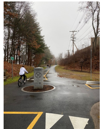
Figure 1: Project Locus Map Cochituate Rail Trail (CRT) Natick, Massachusetts